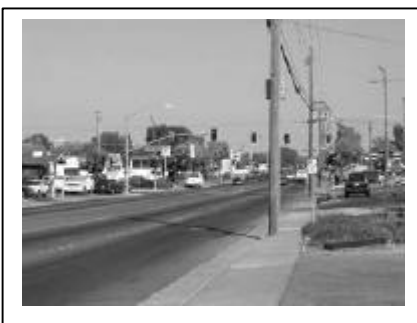
Auburn Boulevard today