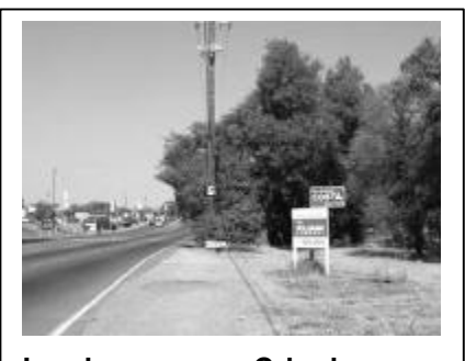
Landscape near Cripple Creek