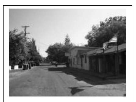
Storefronts on side street adjacent to Sylvan Corners