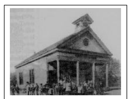
Historic Sylvan School

The history of the area can been seen in the pattern of roads, blocks, and remaining undeveloped parcels. The community on the east side of Auburn Boulevard grew out of citrus groves. Originally, the rural home sites were intermingled with citrus groves organized by rural lanes. Near Sylvan Corner, these older residential areas back up against commercial businesses fronting on Auburn Boulevard. Over time, these residential areas have filled in. Residential development on the west side of Auburn Boulevard has been developed as many post war suburbs with wider roads, cul-de-sacs, and less architectural variety.