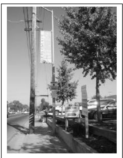
Auburn Boulevard has a variety of streetscape edge conditions.