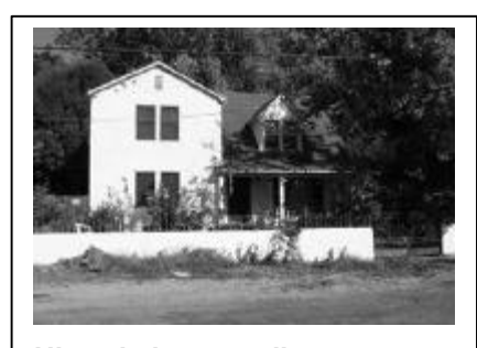
Historic house adjacent to Sylvan Corners

The fifth subarea includes Auburn Boulevard frontage between the DeVille Oaks subdivision on the south and the Roseville-Citrus Heights City Limits on the north. This area is characterized by businesses that take advantage of their proximity to I-80. This includes "big box" retail (Big K and Smart & Final), fast food (Jack-in-the-Box), and other auto-oriented businesses. The professional office buildings at Twin Oaks and Auburn Boulevard represent some of the better quality development with parking located behind the buildings and attractive landscape and streetscape.