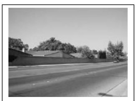
Portions of Auburn Boulevard have edges that are constrained by walls.

The Auburn Boulevard Specific Plan area includes about three miles of street frontage on the main corridor and another three miles of side street frontage. The sidewalk system is incomplete, has many vertical obstacles, is interrupted by nearly 200 curb cuts, and offers little separation from speeding traffic. The sidewalks on the east of Auburn Boulevard have streetlight and utility poles. Not all crosswalks have been ramped for disabled access.