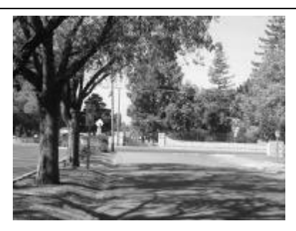
Sylvan Cemetery gate

As in many parts of Sacramento County, there is a rough interface between commercial and residential uses. Parking lots, service areas, trash collection, utilitarian buildings back up to residential areas. Besides the poor physical transition, there are also land use conflicts. The hours of operation, outdoor storage, shipping and receiving, and privacy concerns are use-related. In some cases, buildings and parcels originally designed for retail uses have been adapted for other uses with outdoor material or vehicular storage and more delivery service.