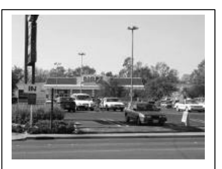
Discount commercial near I-80

The street frontage between Pratt and Sycamore Streets on the east side of Auburn Boulevard adjacent to a trailer home park has several well-established Modesto Ash trees planted in a sloping lawn median between the sidewalk and parking lot of the mobile