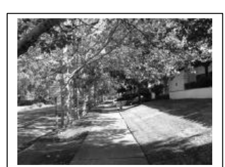
Portions of the Boulevard with newer development have desirable sidewalk and canopy trees.

One of the defining characteristics of Auburn Boulevard is its changing elevation along the 1.5-mile roadway segment. There is a 31.1-foot variation in elevation in the overture length of the Planning Area. The Boulevard's high and low spots help define the five sub areas. Starting from the south, the Sylvan Corners/Cemetery area has high points at Old Auburn Road (elv. 152.0) and Kanai Avenue (elv. 148.5). The second sub area drops from Kanai Avenue down to Antelope Road (elv. 138.7). Cripple Creek is the lowest point along the Boulevard (elv. 133.5). The forth sub-area rises in elevation from Cripple Creek to a high point near Grand Oaks (elv. 147.4) and down again to Sandalwood Drive (elv. 153.8). From there, the fifth sub-area climbs up to the Roseville border (elv. 157.4).