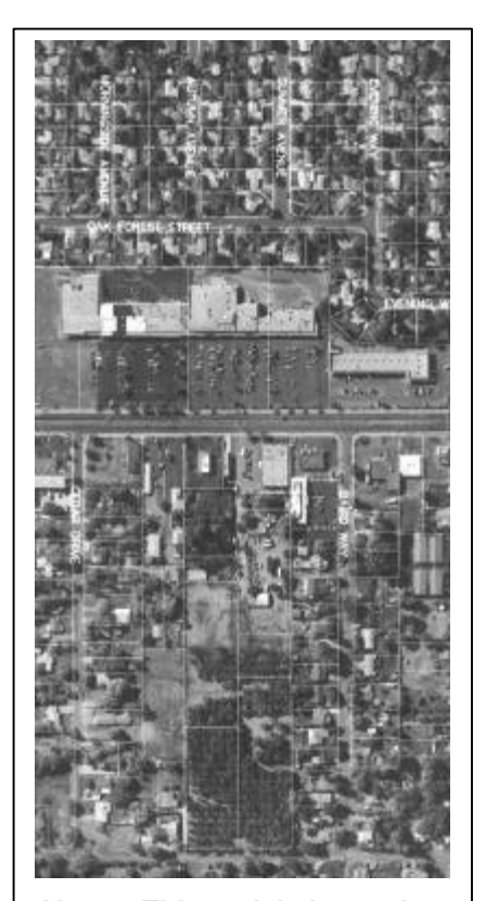
Above: This aerial shows the development patterns of Auburn Boulevard's neighborhoods. The west (top of picture) has developed as many suburban post-war neighborhoods. The east part of the area (bottom of picture) has remnants of orchards and rural residential lanes.