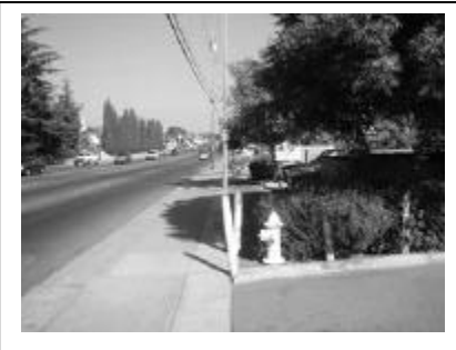
Landscaped street edge near Sylvan Cemetery

Large commercial lots with vast asphalt parking lots dominate the western side of Auburn Boulevard in this sub area. There are only a few street trees of varying species, most of which have been installed recently and have not reached mature size. These do little to define the streetscape. Low shrub planting between Grand Oaks Boulevard and Rollingwood Boulevard help screen some of the parking, but this landscaping is spotty and does not provide a continuous row of screening for the parking lots. A lone subdivision interrupts the pattern of the surrounding large